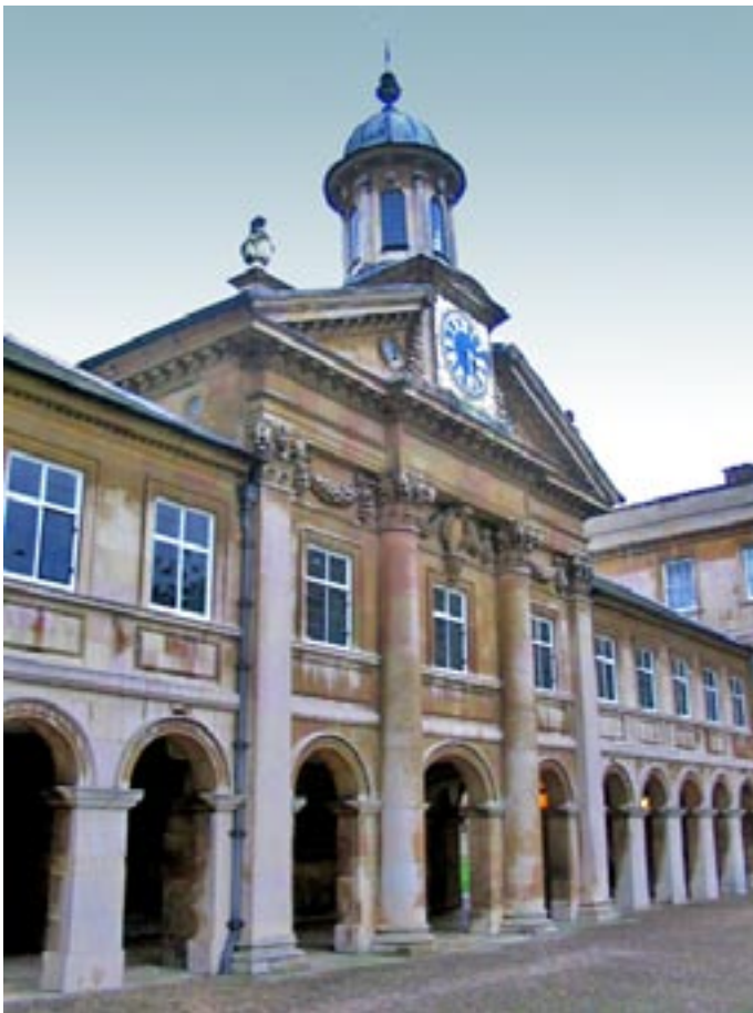
The Wren Chapel at Emmanuel College, Cambridge. In the middle of the seventeenth century the college was a stronghold of the Cambridge Platonists who believed reason was the 'candle of the Lord'.

Cambridge can lay a fair claim to be the cradle of the European Enlightenment. It was here in the seventeenth century that a conception of human reason as a source of knowledge was stressed. It was here that the foundations of modern science were laid by Newton and Boyle, amongst others. Reason gradually broke free of doctrinal and theological constraints. Through human experience and, more specifically, through the experimental method of the modern physical sciences, it gradually acquired the autonomy we expect of science. It is its own master. The picture is very much one encouraged by some interpretations of John Locke's work. At the beginning of his famous Essay Concerning Human Understanding he referred to the scientific work of Boyle and others, including the 'incomparable Mr. Newton', and said 'Tis ambition enough to be employed as an Under-Labourer in clearing the ground a little, and removing some of the rubbish, that lies in the way to knowledge'. This is, in effect, the credo of so-called analytical philosophy, which has dominated British philosophy for more than half a century. Science sets the agenda, and makes the discoveries, while philosophy clarifies and interprets the results. Philosophy is thus typically concerned with epistemology, the theory of knowledge. It investigates how we can know what we do know. It itself makes no discoveries, nor produces new knowledge. It follows science and does not sit in judgment on it. Metaphysics,