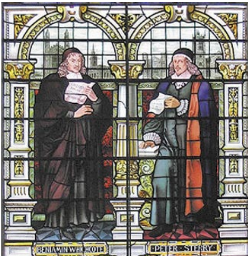
Two of the leading Cambridge Platonists as pictured in the stained glass windows in Emmanuel College chapel. Benjamin Whichcote (1609-83), considered the founding father of the movement, later became Provost of Kings College. Peter Sterry (1613-72) was chaplain to Oliver Cromwell.