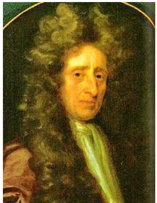
John Locke (1632-1704) whose influential writings included Essay Concerning Human Understanding and The Reasonableness of Christianity .

Locke was an Oxford philosopher. However, it sometimes seems as if his legacy has been moulded to suit the epistemological prejudices of modern Oxford philosophy rather than the other way round. He was no logical positivist, and his empiricism did not extend to ruling out metaphysics. Indeed, in his view of natural philosophy, as evidenced at the end of the Essay Concerning Human Understanding , he was willing to entertain the possibility of knowledge not just of matter and body, but of spirits, and of God. It is no coincidence that in earlier ages, a very influential work of Locke was entitled The Reasonableness of Christianity . In it, he most significantly referred to reason as "the candle of