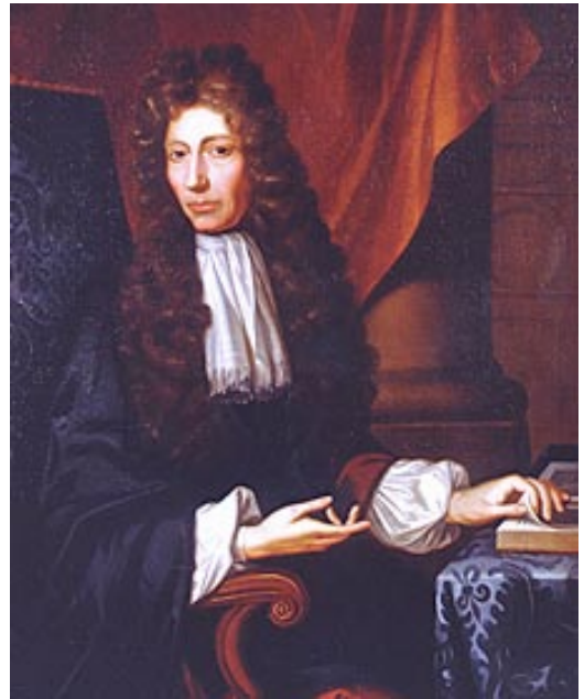
Robert Boyle (1627--91) one of the founders of modern science. In 1690 he wrote The Christian Virtuoso to argue that the study of nature was a central religious duty.

At the beginning of the Enlightenment, human reason was not regarded as self-sufficient and autonomous. It was valuable not because it set itself up against revelation and any belief in a world beyond the natural order, but because it reflected the rationality of the Creator. There was no question of humans getting above themselves as a result of this, because our reason is a pale and flickering thing, compared with the light of God's wisdom. Nevertheless it was sufficient to enable us to cast light on things, and to gain some knowledge. There was plenty of room for error and partial knowledge, but we were, it was thought, made in the image of God and could obtain a glimmer of understanding through science, and other operations of the unaided human mind. Yet, according to this view of reason as rooted in God, human rationality was not unaided. It was, in a general sense, as much entitled to be considered revelatory of God's will and purposes, as the more specific revelation taught by Christianity. It may be true that now 'we see through a glass darkly' in contrast to facing God beyond this life. The Platonism of the Cambridge Platonists was well able to cope with the contrast with our uncertain and wavering knowledge here and now, and perfect knowledge in another realm. That higher reality is, however, reflected in our physical world. This world, with its structure and order, depends for its meaning on a higher form of existence